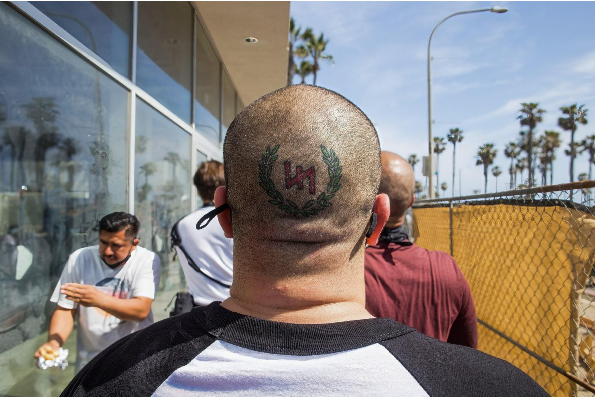
At a 2021 White Lives Matter protest in Huntington Beach, California, a man with a symbol of the National Socialist Legion tattooed on the back of his head.