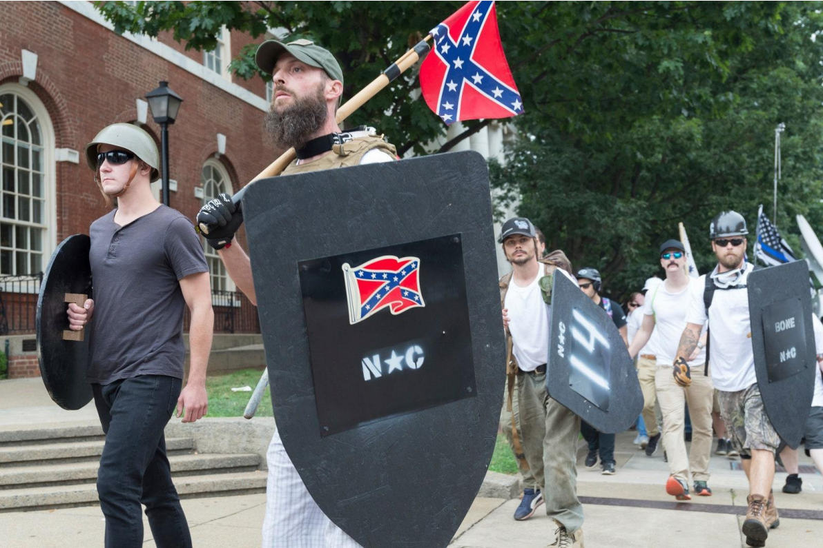
Demonstrators near Emancipation Park (formerly “Lee Park”) in downtown Charlottesville, Virginia, August 2017.