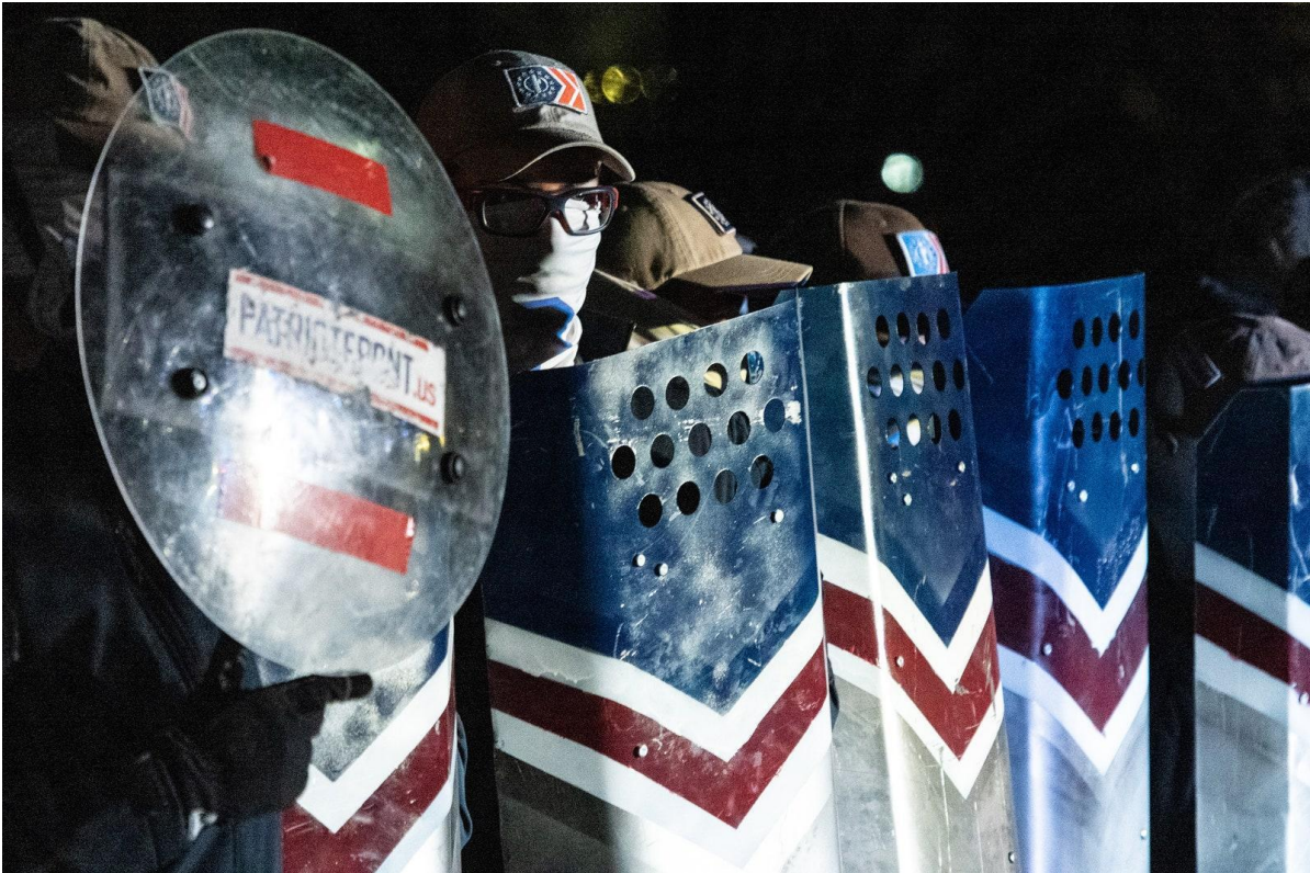
The right-wing Patriot Front in DC in 2021.