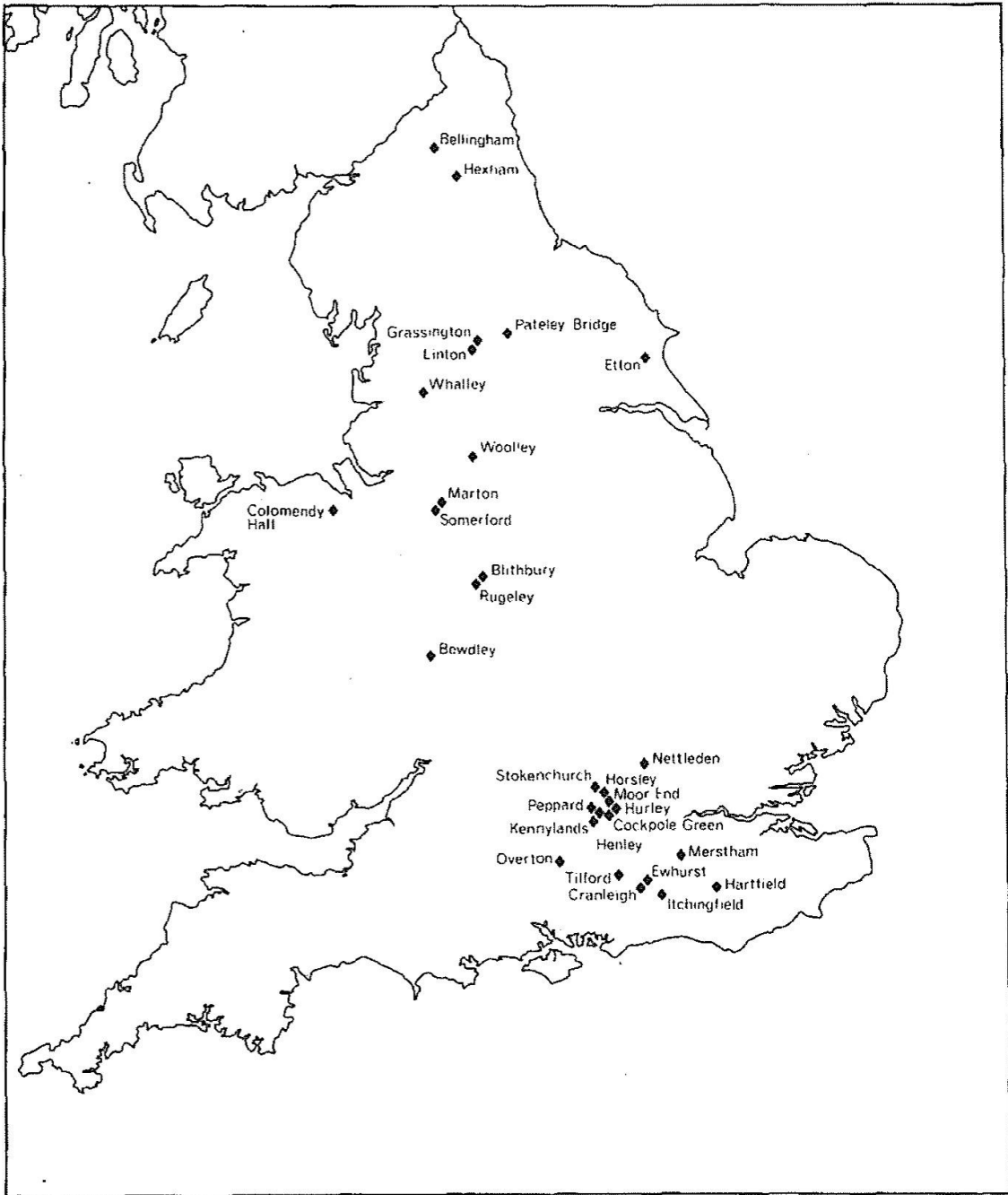
National Camps Corporation sites, 1939