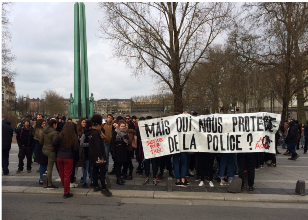
Protests in Nantes

abuses included African girls being tied up, urinated on and raped by multiple soldiers and, girls being forced to have sex with dogs. Once more, those distinctive themes of racialised sexualised degradation and perversion were laid bare. As we campaigned for justice, my body was forced to remember my life in France.