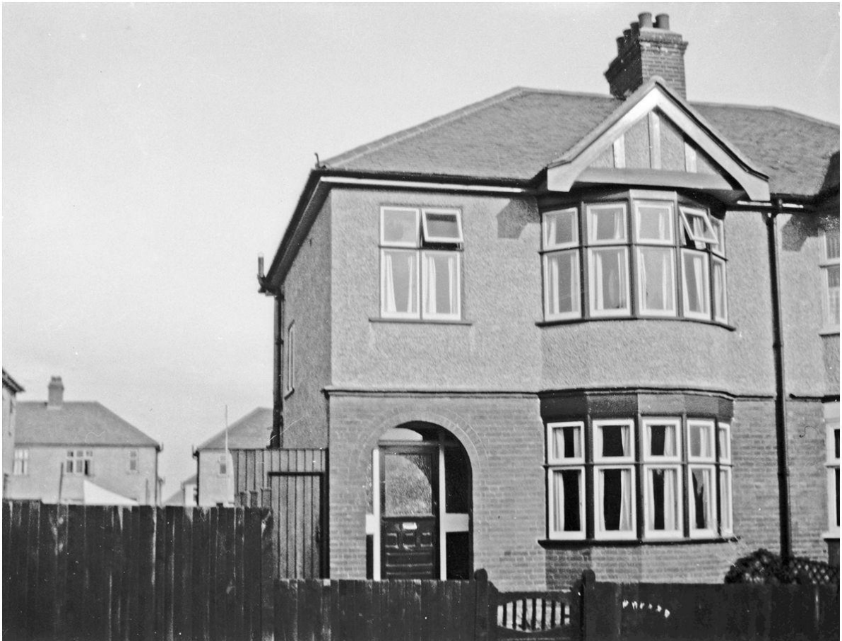
FIGURE 6.1 8 Collingwood Gardens, Wanstead, London.